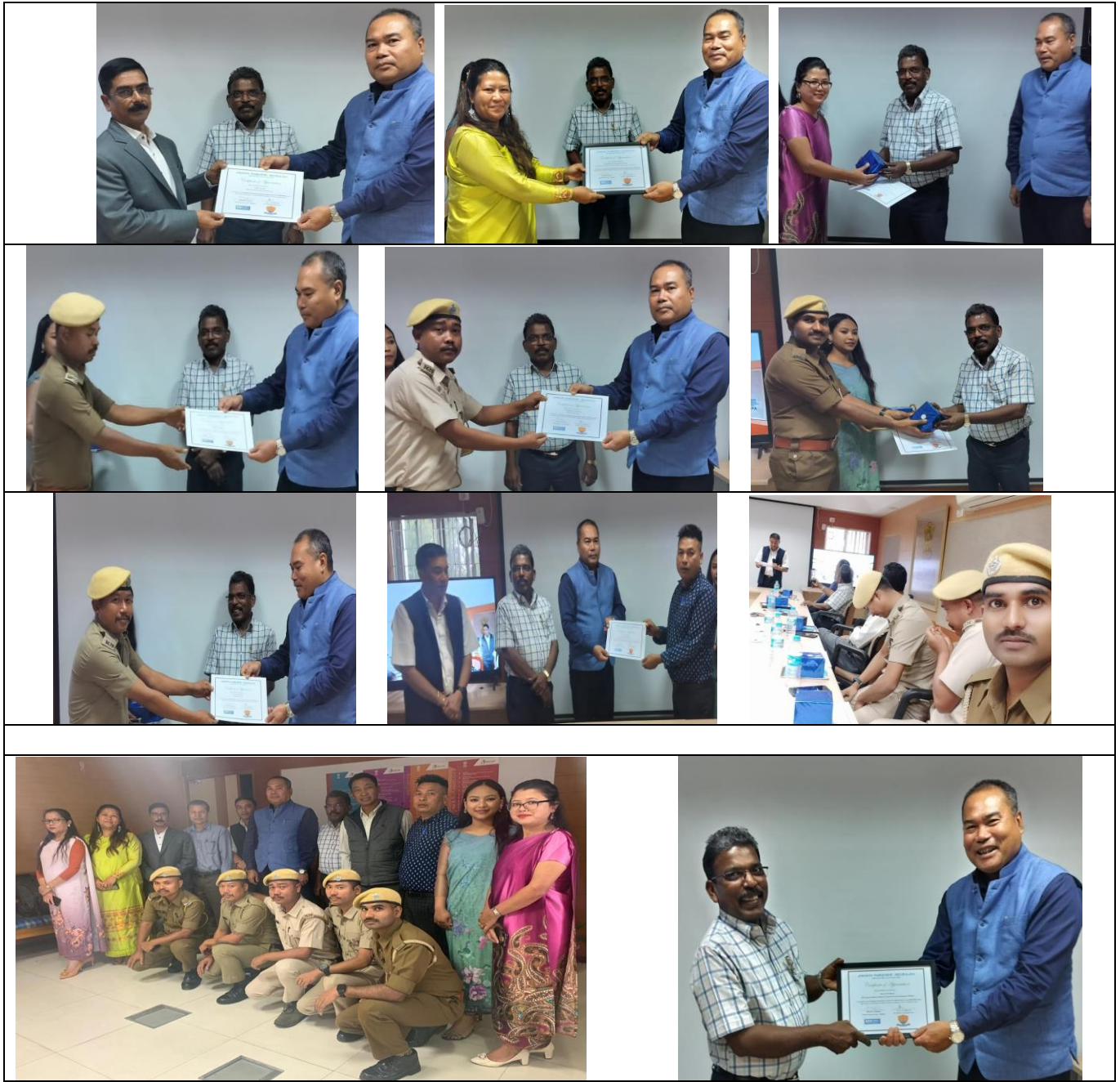
Prepared by : Prisons & Correctional Services in collaboration with NIC Meghalaya